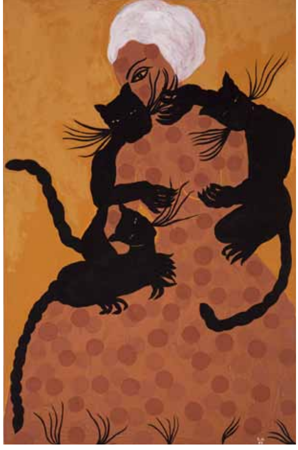
WOMAN WITH THREE CATS - GOUACHE ON HANDMADE PAPER 169.5X112 CM, 2005

Drawing on her personal experiences, stubborn determination and a remarkable self-confidence, her work is conceived as a visual elegy based on this personal mythology and the universal themes of life and art. Like riding a magic carpet from a fairytale world, her works let our imagination wander through enchanted gardens of a lost Paradise.