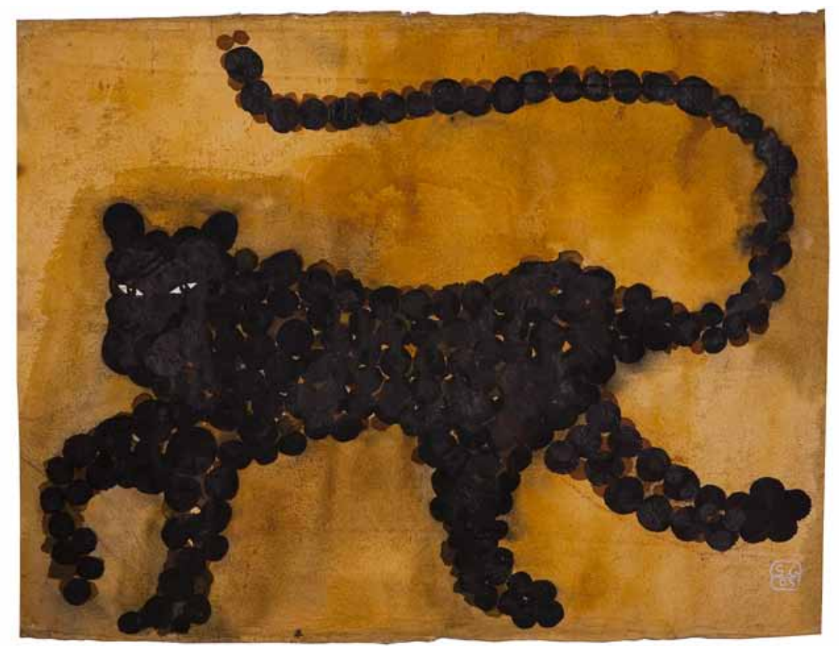
AFTER HUNTING GOUACHE ON HANDMADE PAPER 99.5X174 CM, 2005