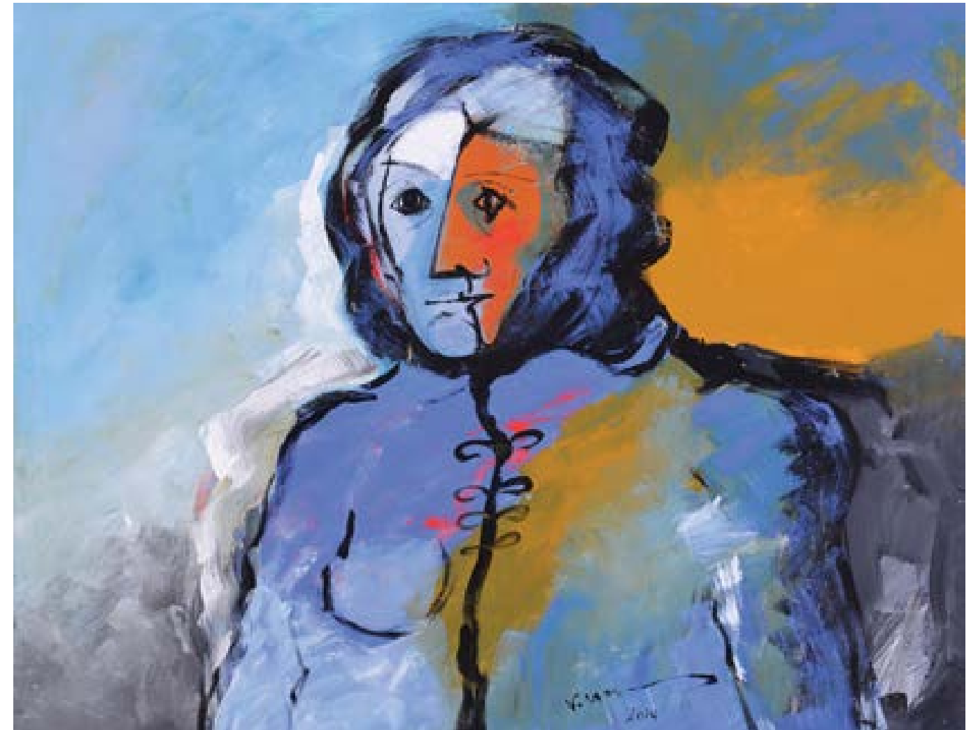
Bilad al-Sawad, 1993. Charcoal on paper, 9 drawings each 65 x 50 cm. Private collection.