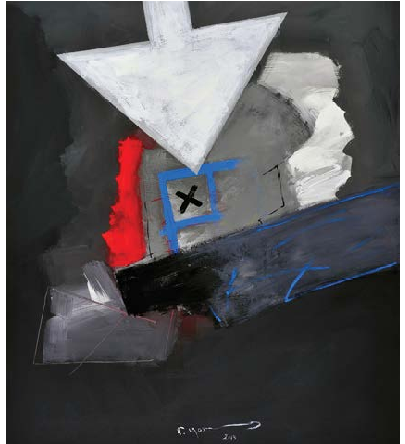
Bilad al-Sawad, 1993, Charcoal on paper, 9 drawings each 65 x 50 cm. Private collection.