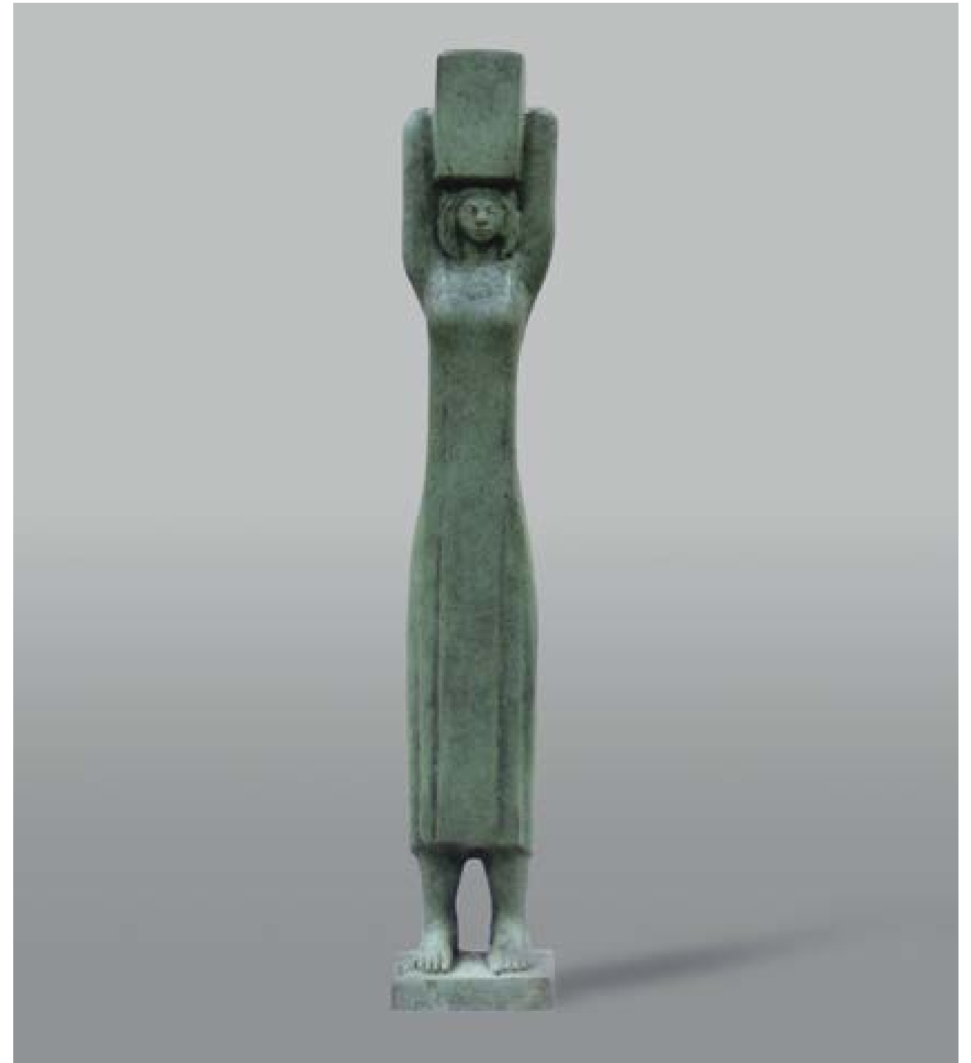
The Tin Holder, Cairo 1952, bronze, edition of 8, 61x10.5x7cm.