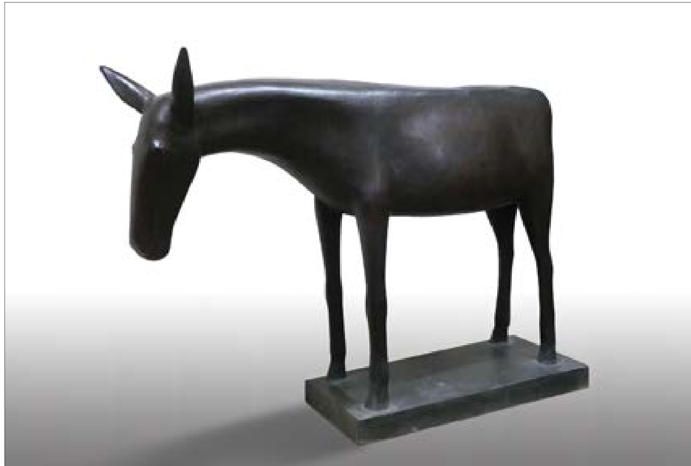
The Donkey, Egypt 1964, bronze, edition of 8, 80x116x31cm.

The Human Factor (11) , Standing Sculpture at the Turn of the Century: Exchange Values and Metamorphoses (12) , Post-Abstract and Data-Mapped: The Conditions of Contemporary Figure Sculpture (13) , After the Fall: The Re-Emergence of the Figure in Sculpture (14) and Bodies Politic (15) . In all five articles, we find the historical references and drivers, set and established by artists like Adam Henein that would lead to the current adoption of figuration in current sculptural styles. Here the story of Henein is the story of sculpture itself, and the change of Henein's style over the years is the same change that happened to figurative sculpture. Figuration in