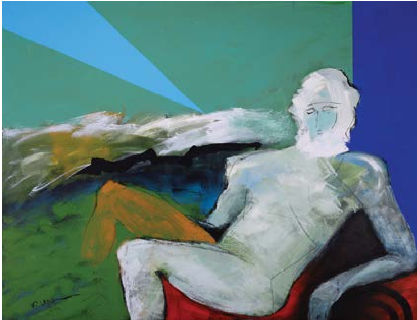
Bilad al-Sawad, 1993. Charcoal on paper, 9 drawings each 65 x 50 cm. Private collection.

In Hosny's work, we see the artist's obsession with creating the codes and symbols -we can look at them now as simulacra - in repetition that they turn to become originals, or surpass the original inspiration, if those ever existed in the real world. Baudrillard in this third order thinks that the simulacrum precedes the original and the distinction between reality and representation vanishes. There is only the simulacrum, and originality - in Hosny's case here means the inspiration from reality - becomes totally irrelevant.