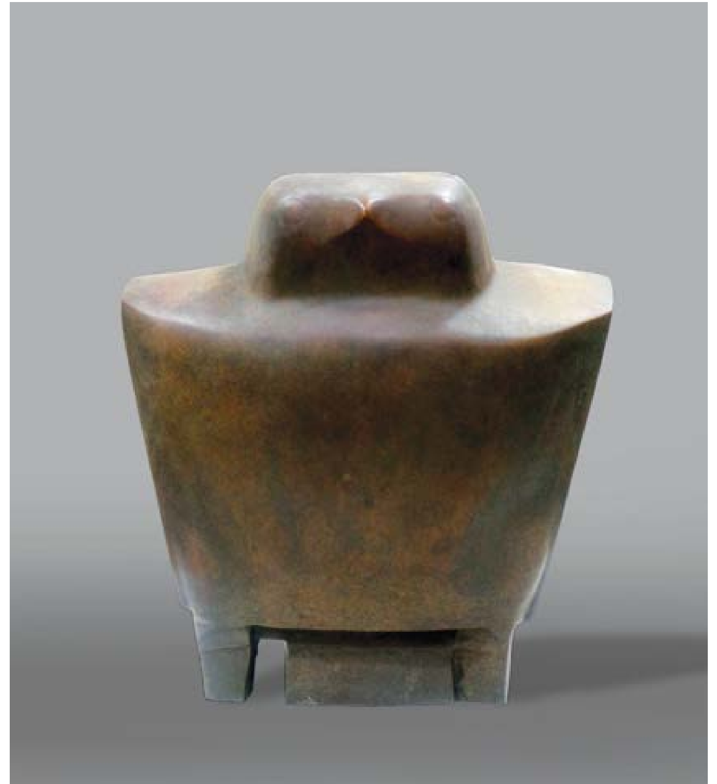
The Owl, Cairo 1963, bronze, edition of 8. 22x28.5x19cm.