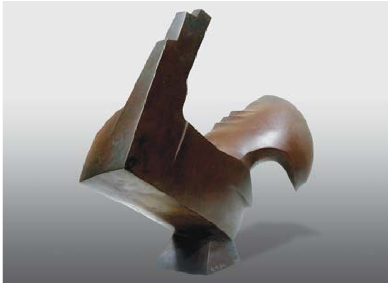
The Rooster, Paris 1979, bronze, edition of 8, 17x40x53cm.