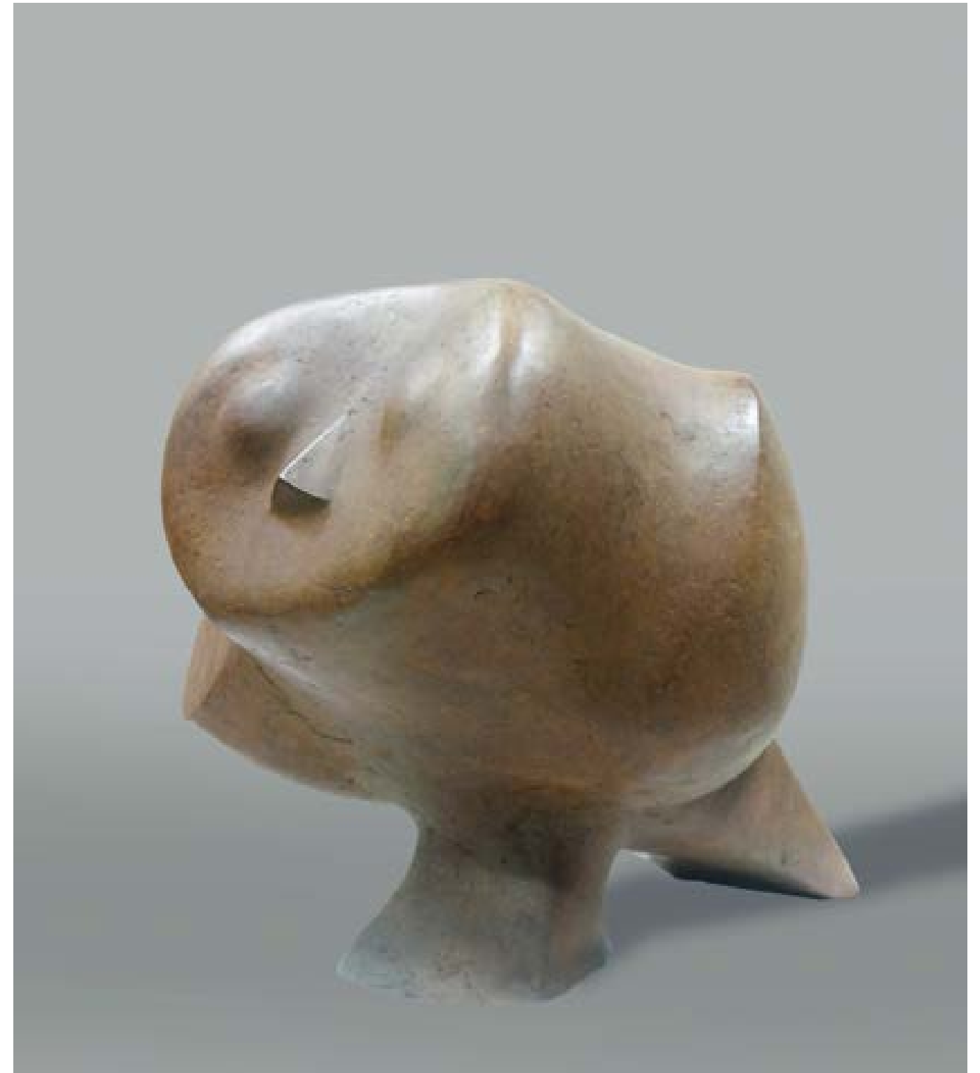
The Standing Owl, Nouba 1961, bronze, edition of 8, 47x22x45cm.