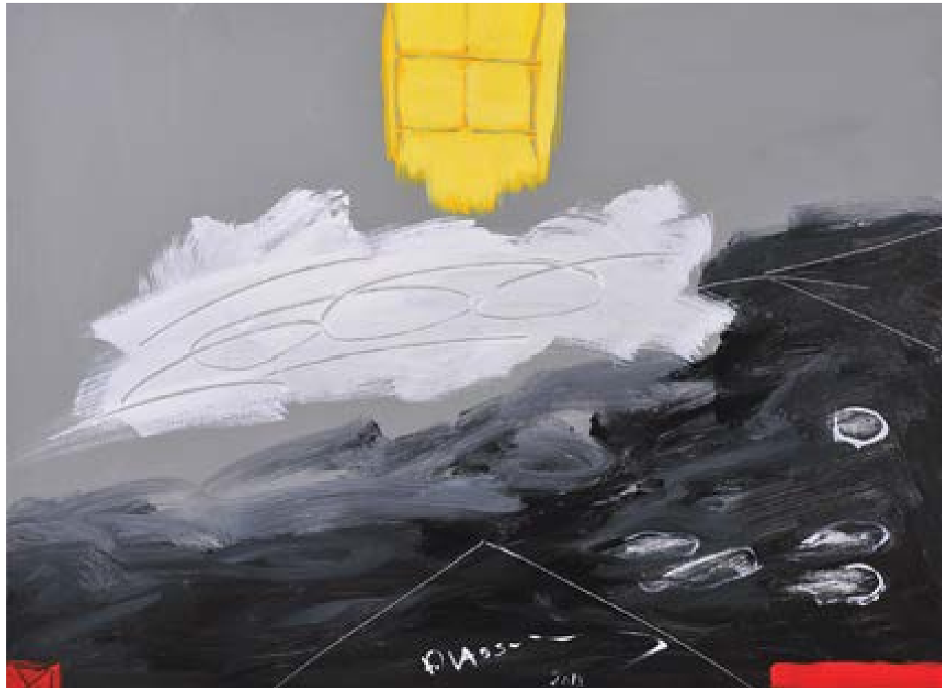
Bilad al-Sawad, 1993. Charcoal on paper, 9 drawings each 65 x 50 cm. Private collection.

of Baroque art, and identify it from High Renaissance or Classical art. Painterly would mean in this case: the blurred, broken, loose definition of color and contour. The opposite of painterly is clear, unbroken, and sharp definition, which Wölfflin called the linear. The dividing line between the painterly and the linear is easier to write about than actually see. For the past six decades, there have been many artists whose work combines elements of both painterly and linear acts, where painterly gestures can go with linear design back and forth, which is the very conspicuous case that perfectly describes the more recent works of Farouk Hosny, who combines lines with colored areas, and mixes the sharp with the blurred. We can speak of Color Field painting or Lyrical Abstraction, and even better or best, not to even try to give a name, and just float with the visual pleasure of sheer painting.