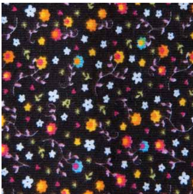
Cecile Elise Sabella, 2008 Limited edition of artist books and prints