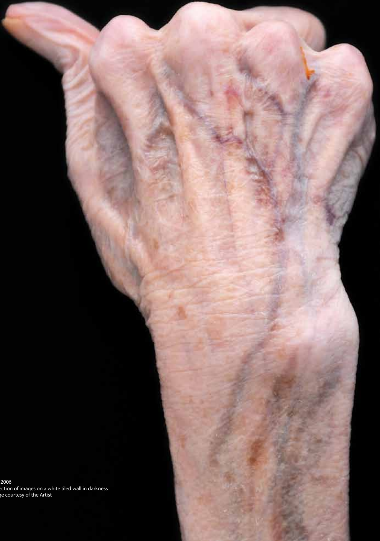
Exit , 2006 Projection of images on a white tiled wall in darkness