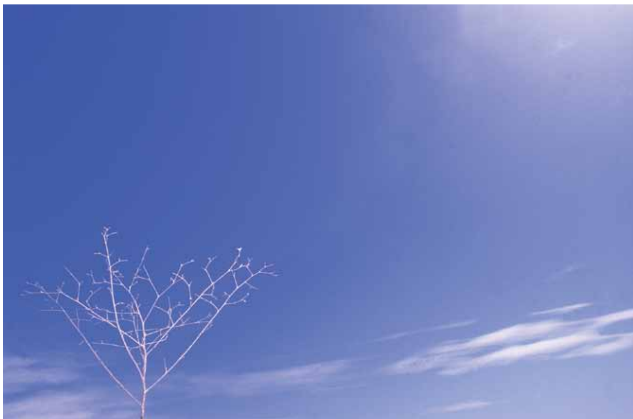
Identity , 2002 colour transparencies, 40/50 cm

The pieces that form this series speak of a childhood Sabella never had, they speak of transformation of context to content, and they ruminate on suffering and home and loss. But amidst his conveyance of confusion, alienation even, in the alternate sides of fabric that look in many ways like they have no link to each other at all, the work also speaks of dialogue and the reality of connectivity even in the face of difference and change. And it was perhaps this moment of discovery of the physics and science of the other side that allowed Sabella to create the realities that form In Exile (2008). It was, one wants to believe, in that fleeting moment by the window looking out, that he looked out on a world, however faulted, that could form a whole.