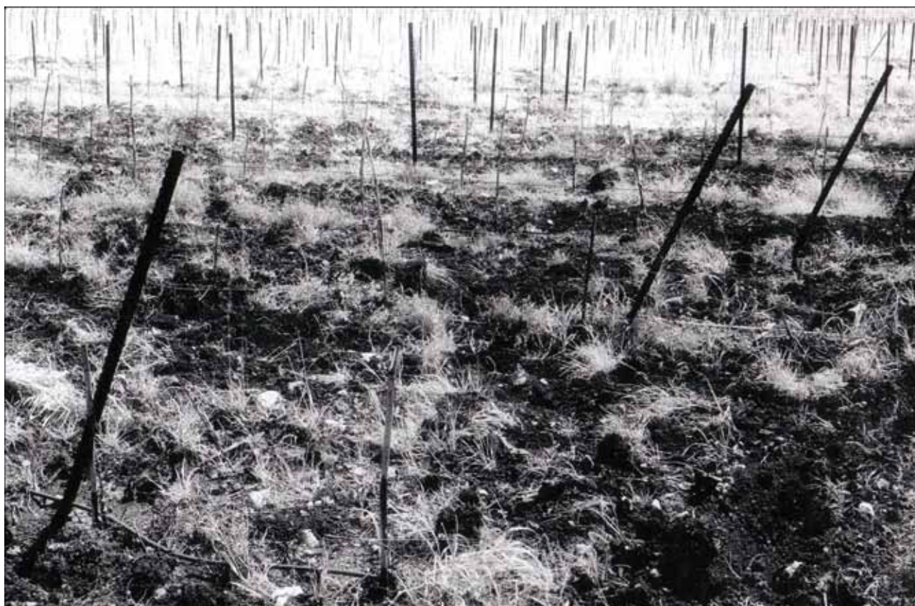
Search, 1997 B&W Infra Red Photography

Jerusalem, a city that he describes as being in exile itself, was as much the undoing of him as it was his making. He discovered through it not only the burden of its own lack of belonging, but the reality that in the city’s exile was but a sliver of a shadow of his life. “Jean Baudrillard said the world has been transformed to an image, we live