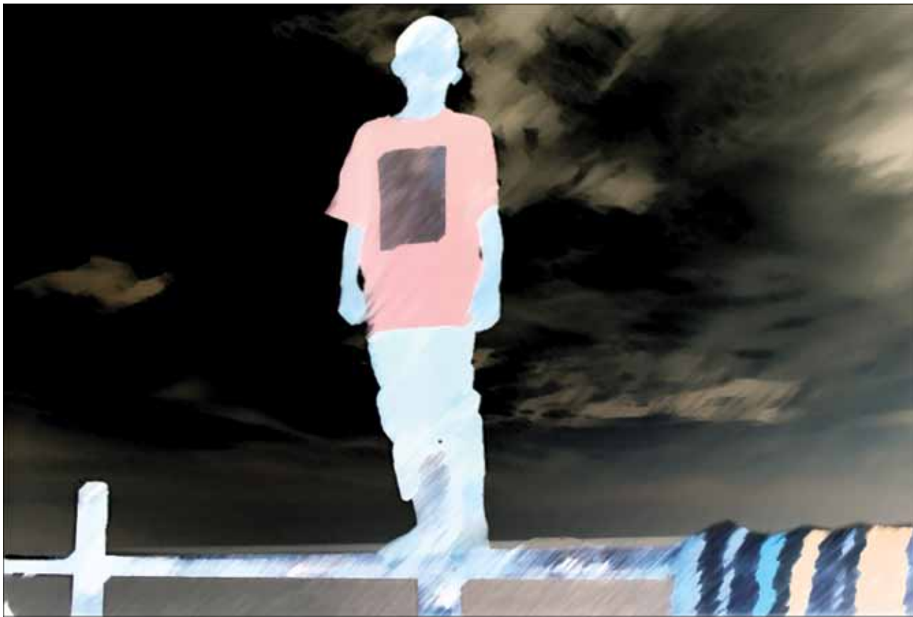
End of Days, 2003 Digital editing. Light boxes installation placed at random in a complete darkened room

in a world where there is a copy with no original, and I realised that Jerusalem had indeed been transformed into an image in people's minds, and I was simply living in that image. This was not where I belonged. There was no home."