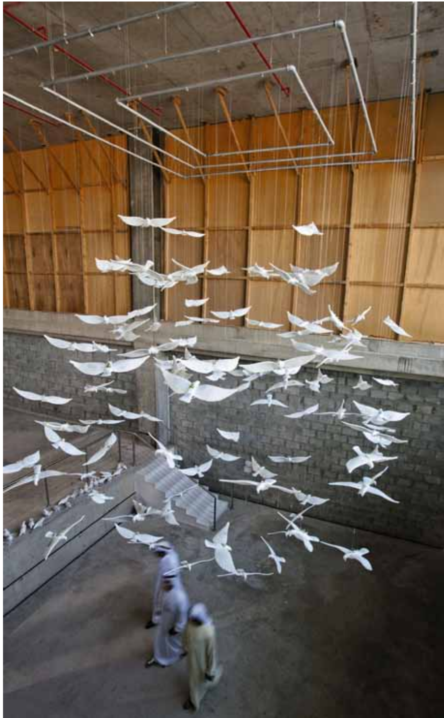
Manal Al Dowayan Installation