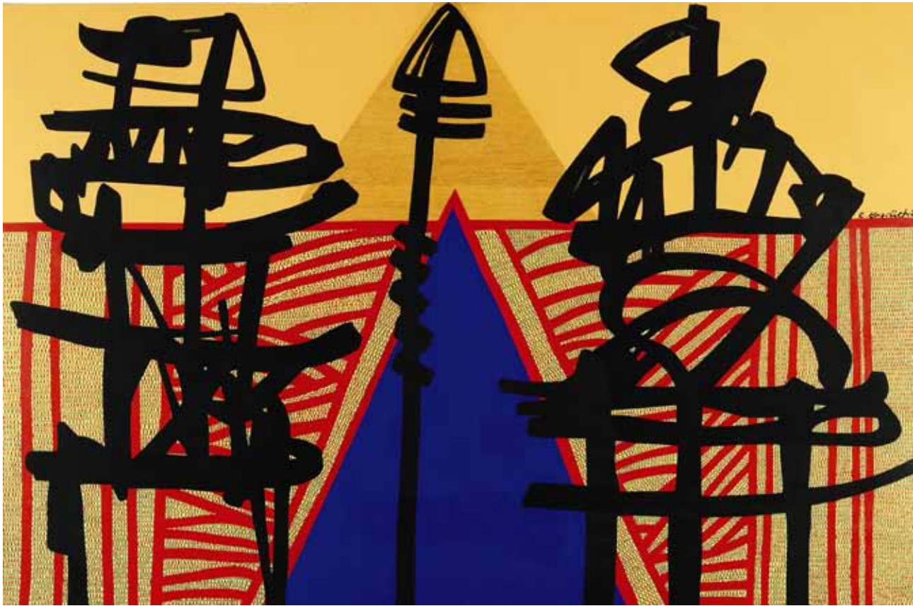
Rachid Koraïchi, Scrutateur De L'arrière Passion , Circa 1985, Acrylic on paper laid down on canvas, 200x300cm - Courtesy of Sotheby's Auction House.

to date. Produced in the wake of the upheavals in Tunisia during December 2010 and the Arab Spring, with its dark hues and dense composition, it reflects the profound and emotional impact of this historical event on the people of the region. In contrast to the more tradition-oriented works of the aforementioned artists, today's generation of talented artists who are in the midst of cultural and religious upheavals are producing works that are more overt in incorporating their political and social critiques.