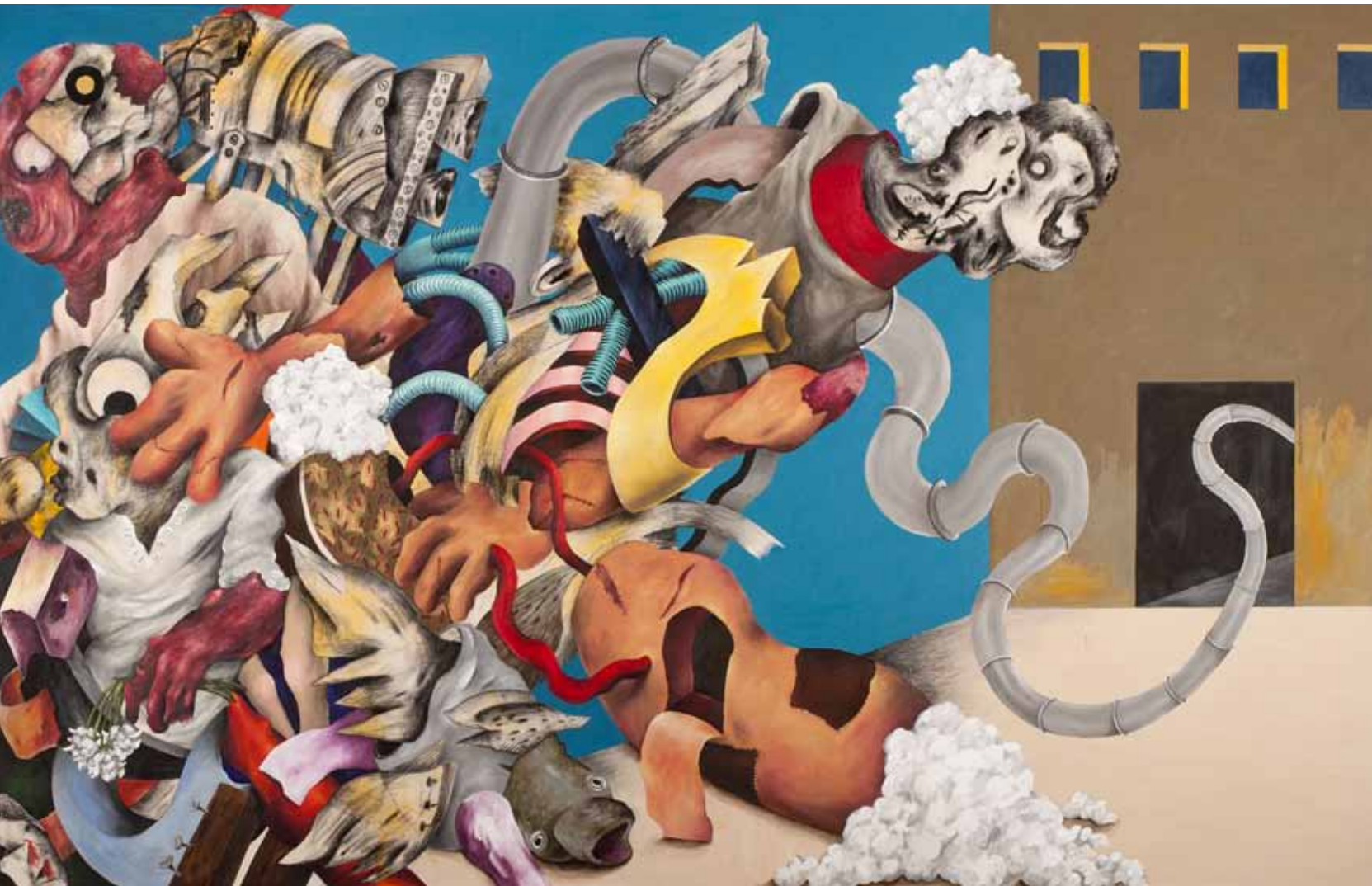
Ahmed Alsoudani, Untitled, 2011, Acrylic charcoal and gesso on canvas, 157.3x248.3cm - Courtesy of Sotheby's Auction House.

extremely high caliber that capture the attention and appeal to the tastes of the international art market. An important development is that while there is a distinct appetite from buyers in the region for works by artists from the region, the new generation of artists are no longer necessarily categorized or pigeon-holed by their region of origin, because the art speaks for itself.