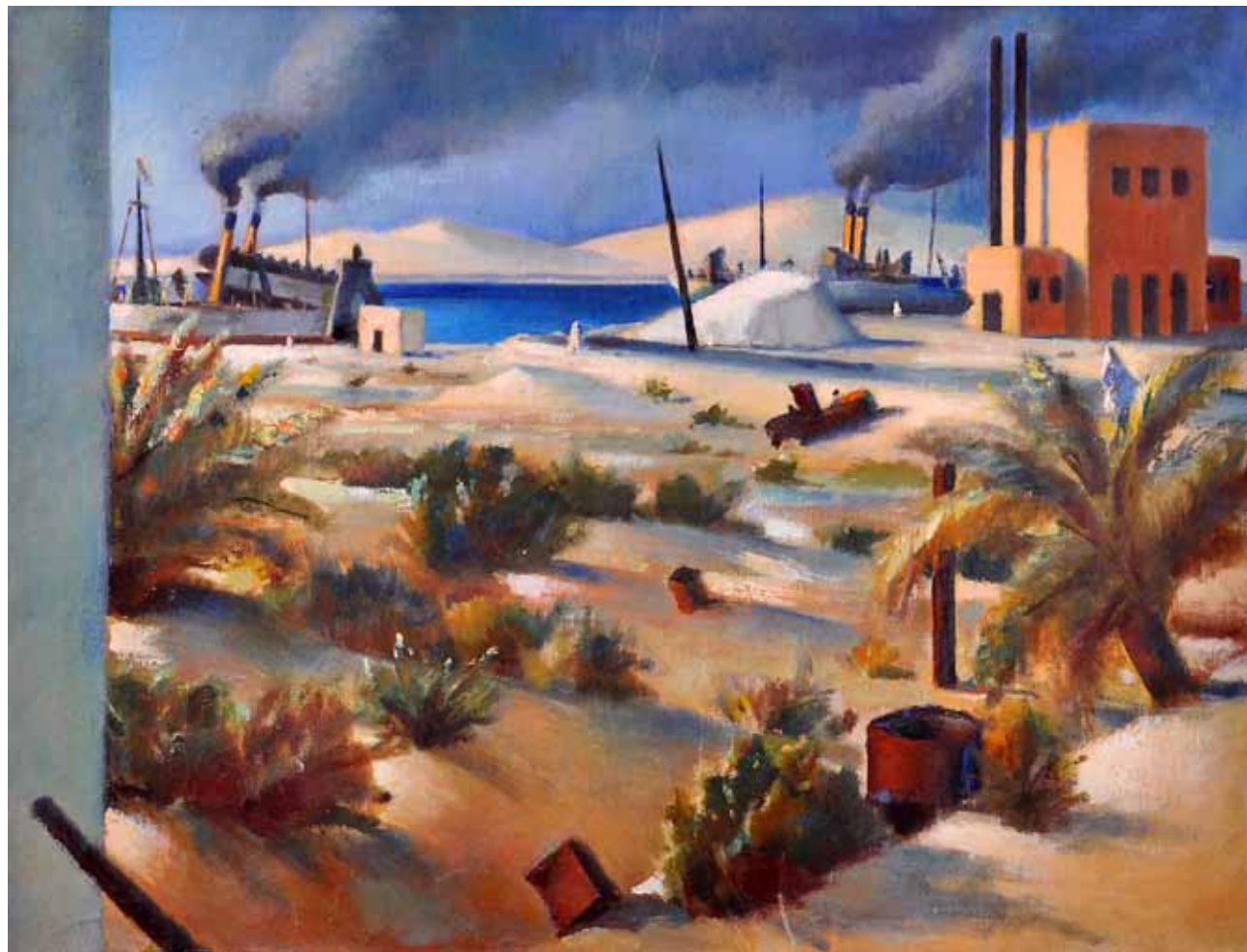
Mahmoud Saïd, Le Port de Marsa Matrouh , 1948, Oil on canvas, 57.7x76cm

By: Lina Lazaar Jameel, Specialist at Sotheby's in Post War and Contemporary Art