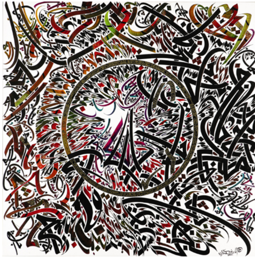
Nja Mahdaoui, Soda , Graphemes series , 2011, Indian ink on canvas, 200x200cm - Courtesy of Sotheby's Auction House.

collectors will be drawn to the technically brilliant and intellectually virtuosic work of the works of Manal Al-Dowayan and Batoul Shimi, which are centered around human rights - in particular women's rights - informed by their own experiences.