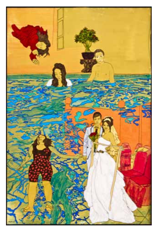
Untitled 1, I, in our midst series, 2012, mixed media, 123x184cm - Courtesy of Khak Gallery.

Hashemi developed her abstract fields of patterns and human forms into precise outlines of her photographs that render the reality of the gatherings, and the artist's conflicted relationship to them, all the more acute. Layers of traditional fabrics are shielded behind transparent plastic sheets, protected and preserved from the wear of the outside world and from the passing of time, just as the artist herself was as a girl. Hashemi felt safe within her family environment, sheltered from the outside by male relatives, though at the same time, considering modern-day Iran's turbulent developments, acknowledged the illusory existence her family upheld