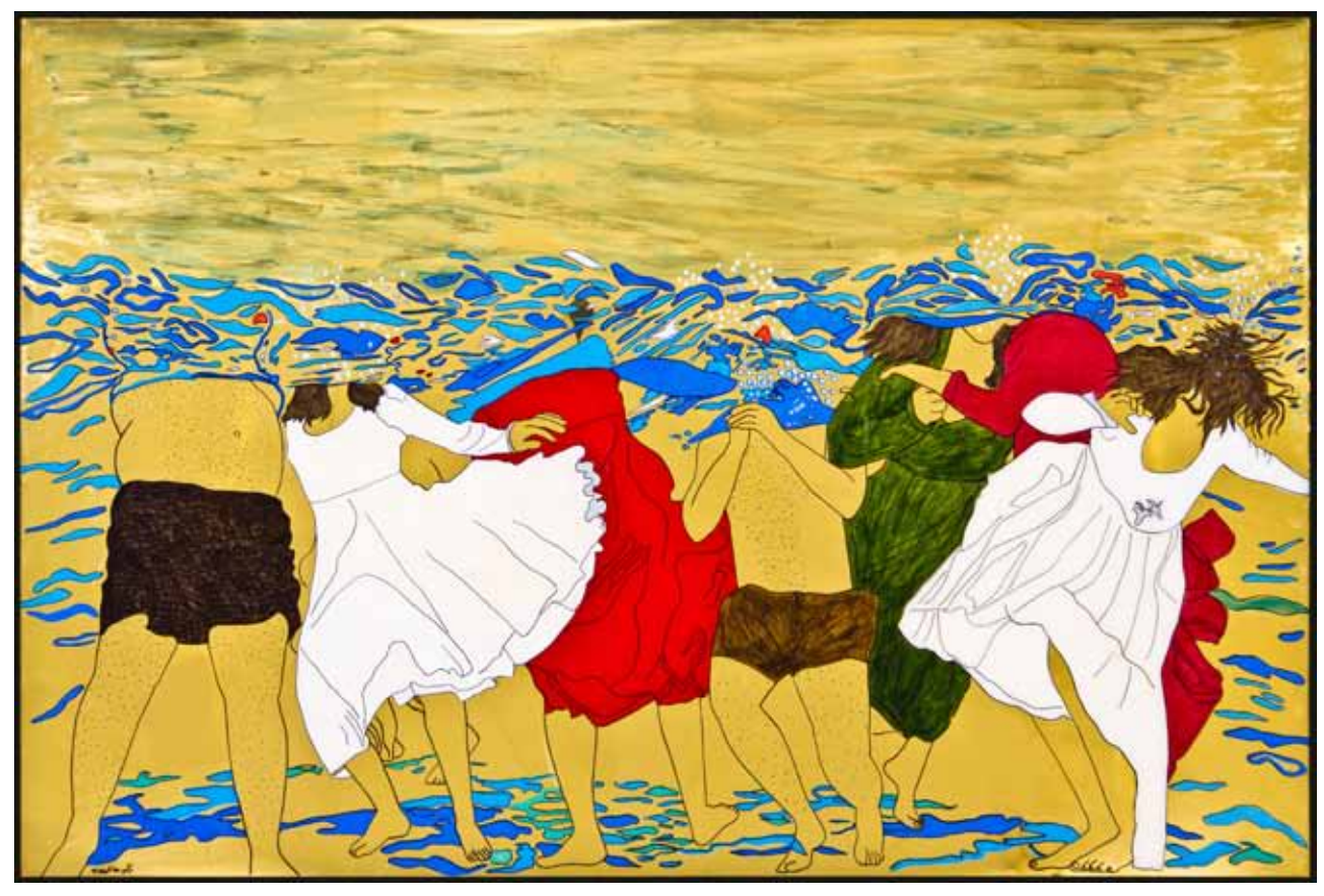
Untitled 4, I, in our midst series, 2012, mixed media, 123x184cm - Courtesy of Khak Gallery.

reflects the present moment, intermingling time and relative realities. The viewer mingles with the scene depicted but remains unabashedly disconnected, a sensation mimicking her own experience of the scenes as she lived them. Hashemi explains that her works are depictions of 'a moment between yesterday and today, of what I have seen so far and what I see at this moment'. There is an element of confusion between time, between what is real and imagined, and what is feared and appreciated. The layering of textures, patterns and images create the sense of displacement and conflict the artist carries. Her practice has shifted away from strained ceremonial traditions like wedding ceremonies and family meals to focus on moments that transpire unselfconsciously. Hashemi captures fleeting domestic moments in outlines that she fills with her signature array of patterns. She is interested in the simple gestures and habits with which people live, globally commonplace and yet deeply specific to cultures, and within them,