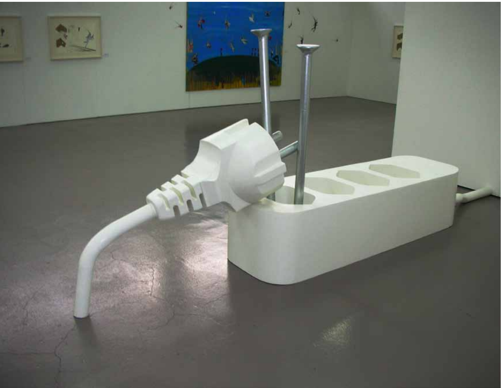
Ahmed Badry, The Provisionary that lasts , 2013, mixed media, 165x68x443cm.