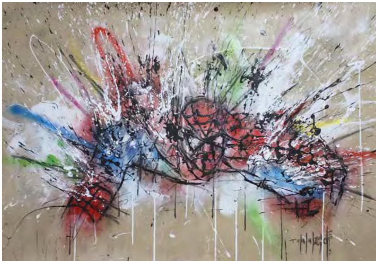
Talal Al Zeid, Spiderman , 2013, mixed media on paper, 110x150cm.

the degree of interest that the artists show in what is going on around them. Do they really want to meet fellow artists from Switzerland and visit their studios? How keen are the artists on getting together with collectors? How interested are they in extending their knowledge and discovering new things through such activities as visiting museums and attending exhibitions?" explains the program director. "We are constantly urging our artists to make the most of their time in the residence, to learn as much as they can, to open their eyes and see things anew. But we do not put undue pressure on them. Ultimately, they can choose to do what they like."